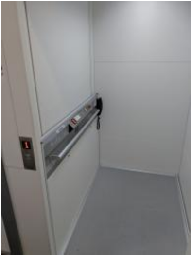
Inside the lift.

The lift on the first floor, near the stairs and door to the Community Room.