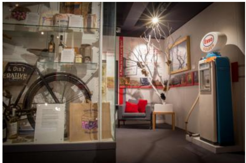
Part of the Rural Life gallery including a petrol pump and display cases.

This area of the museum is carpeted and features low lighting.