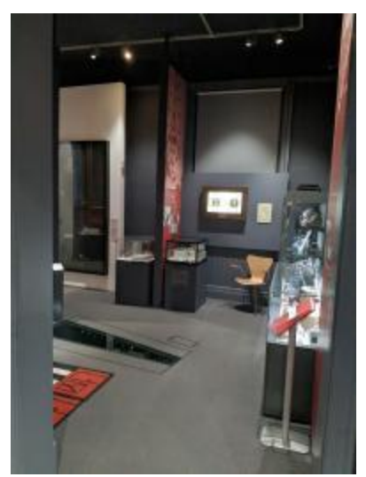
Melton Through the Ages gallery