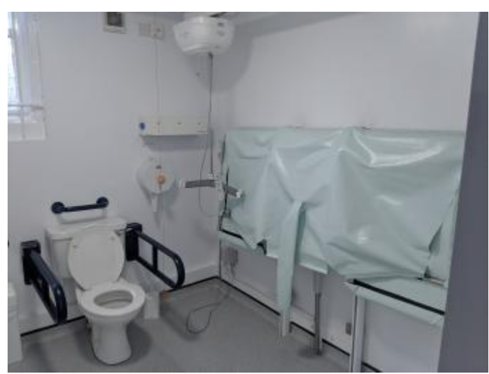
Accessible toilet and Changing Places facility.

Doors to men's, women's and accessible toilets including a Changing Places facility.