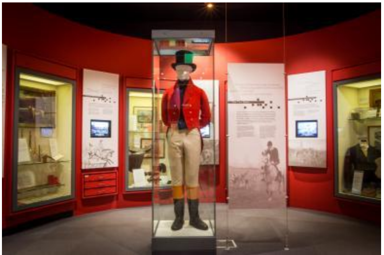
The History of Foxhunting gallery featuring displays and a costumed mannequin.