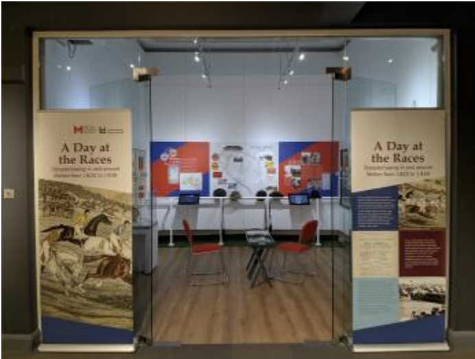
The temporary exhibition gallery, featuring 'A Day at the Races'.

Videos may be used in exhibitions and we ask exhibitors to include subtitles and/or a transcript.