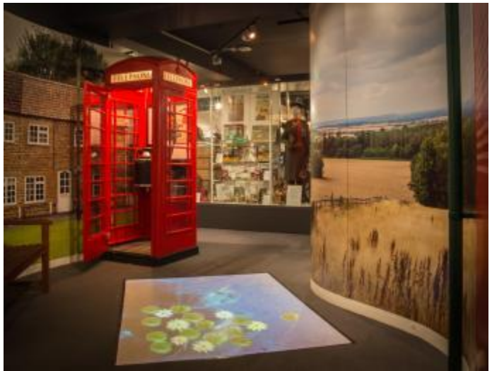
The interactive floor and telephone kiosk, which both play sound.